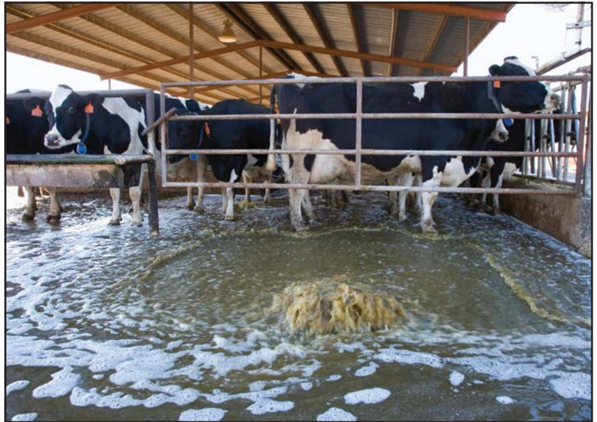
Flushing an alleyway at a dairy in California

There is very little publicly available information about the lifespan of anaerobic digesters and the level of performance over their lifespan. However, the high attrition rate of digesters installed since 1989 suggests that the public dollars spent on digesters may not be as effective in controlling methane emissions over the long run as initially thought. According to a 2015 report entitled Greenhouse Gas Mitigation Strategies for California Dairies ( 'Sustainable Conservation Report' ), 15 a number of digesters that received significant public funding are no longer in operation. Many of the digesters installed in California since 1989 have ceased operations because of financial distress, high operational costs, and/or complexity of their operation. 16