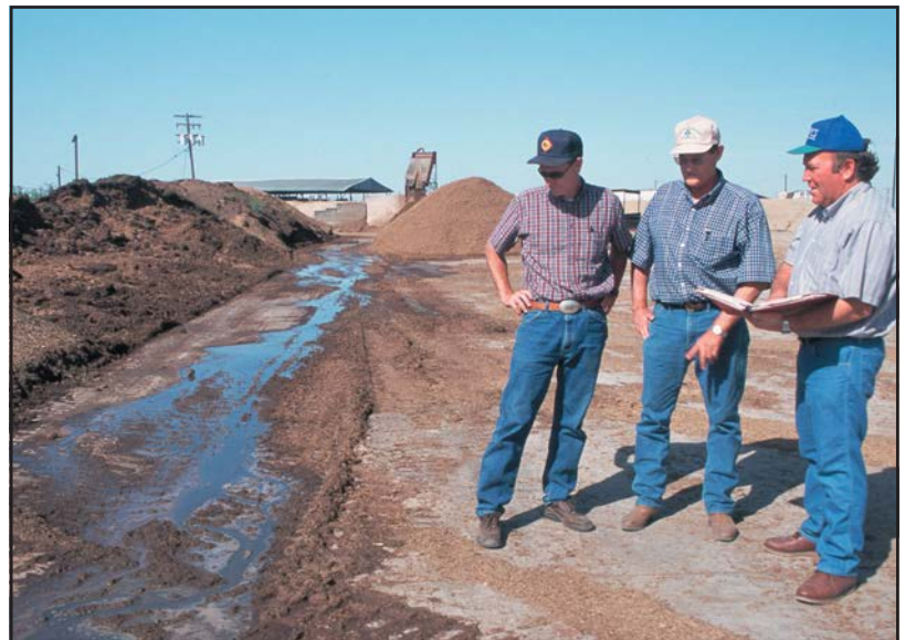
NRCS employee discusses manure management with dairy farmers in Stanislaus County

We discuss our recommendations in detail below.