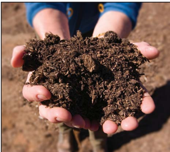
Compost made from manure and other organic solids

The anaerobic digestion of dairy waste with additional organic waste streams, known as ‘co-digestion’, can significantly increase the energy produced and provide additional operational benefits. In some geographic regions with large concentrations of dairies, multiple operations could contribute manure to be co-digested along with other organic waste streams that are increasingly diverted from landfills under the state’s SLCP and waste reduction strategies. Co-digestion could also reduce the risk of state investment by developing digester models with multiple diverse stakeholders, increased flexibility in operating needs, and more secure ownership structures.