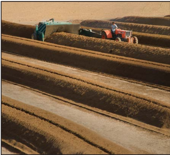
Windrows of compost on a dairy farm in California

The expense of using dry systems can be a concern, 37 although no California studies have fully examined the total costs and benefits of these options as compared to liquid-based methods of manure management. The infrastructure and maintenance costs of a dry system will vary depending upon a variety of factors, but capital costs will generally be lower than those of an anaerobic digester. Given the poor track record of digester technologies in the state (as discussed above), dry management systems could prove to be a more reliable option for state investment in some circumstances.