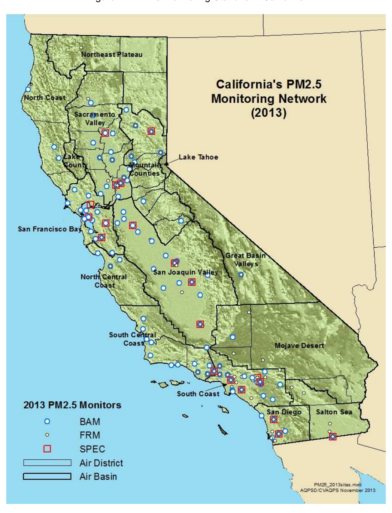
Figure 1: PM2.5 Monitoring Stations in California