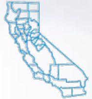
LOCAL AIR DISTRICTS