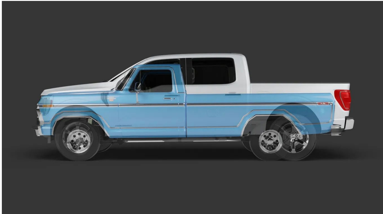
A 1970s-era Ford F-150 compared to a modern version. Graphic: Will Chase/Axios

How pickup trucks became so imposing: https://www.axios.com/2023/01/23/pickup-trucks-f150-size-weight-safety