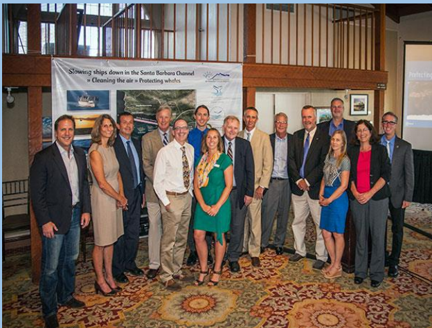
Speakers and Participants in a 9/10/14 forum on the Trial Program.