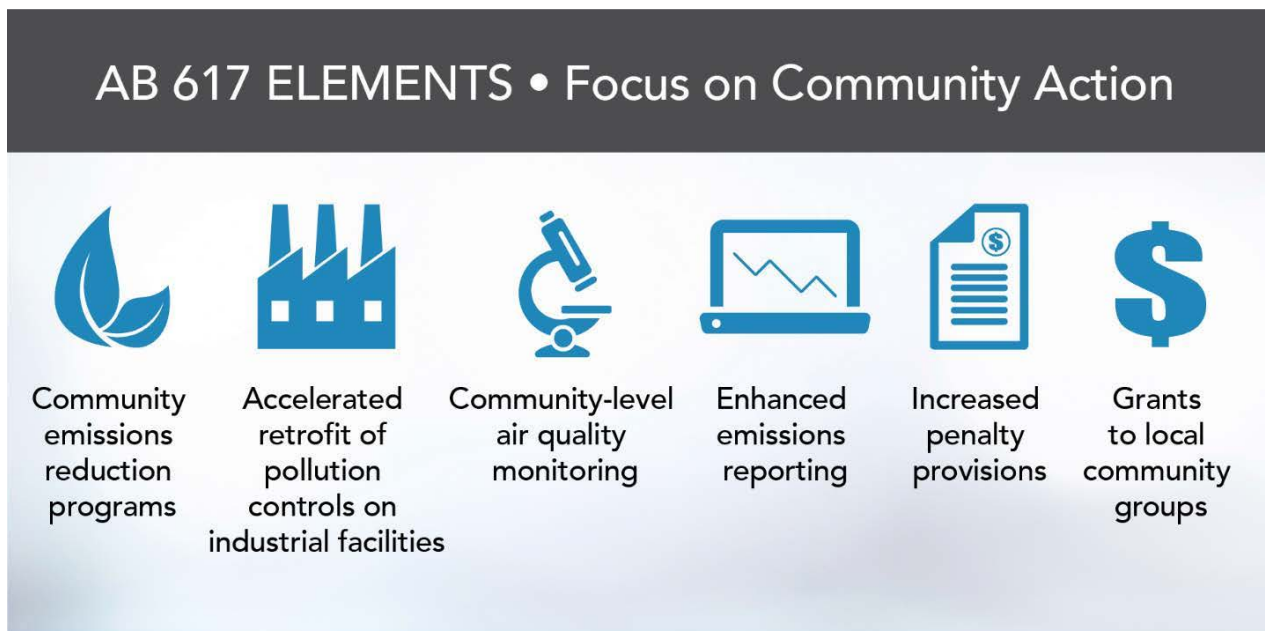
Figure 1 Community-Focused AB 617 Elements

Most importantly, underpinning AB 617 is the understanding that community residents must be active partners in envisioning, developing, and implementing actions to clean up the air in their communities. Figure 2 outlines the new actions that form the core of the California Air Resources Board’s (CARB) vision for AB 617 and implementation of the Community Air Protection Program (Program). As part of this process, we will align Program priorities and objectives with other CARB and air district actions for air pollution reduction and financial support to help expedite implementation. Together, these actions are designed to deliver new emissions reductions in impacted communities, provide accountability and transparency, and promote a collaborative process for working with communities as partners to identify and implement solutions.