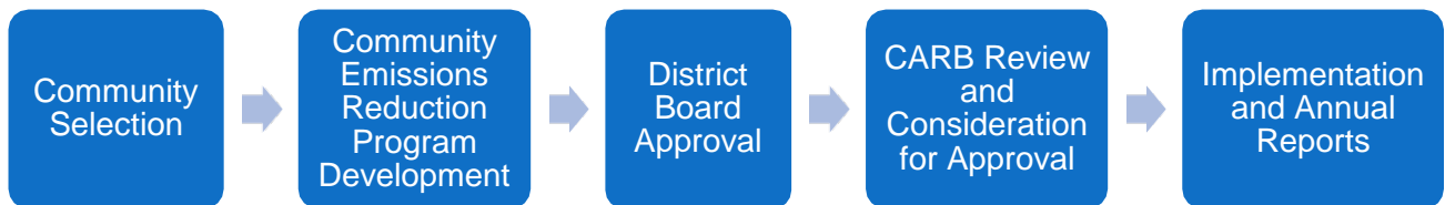
Figure 4 Overview of Community Emissions Reduction Program Process

The overall elements for inclusion in the community emissions reduction programs are summarized in the checklist provided in Table 1, with a detailed checklist provided in a separate appendix. CARB will review each air districts' Air Quality Management Plan (AQMP), Regional Transportation Planning Organization's (RTPO) Regional Transportation Plans (TRP), Ports Clean Air Action Plans and community emissions reduction program to ensure they meet the requirements and will reduce air pollution exposure in the designated community. The detailed checklist will form the basis for CARB's review and consideration for approval process for each community emissions reduction program.