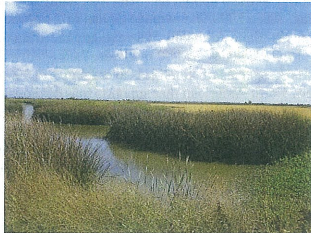
Critical Habitat Pond