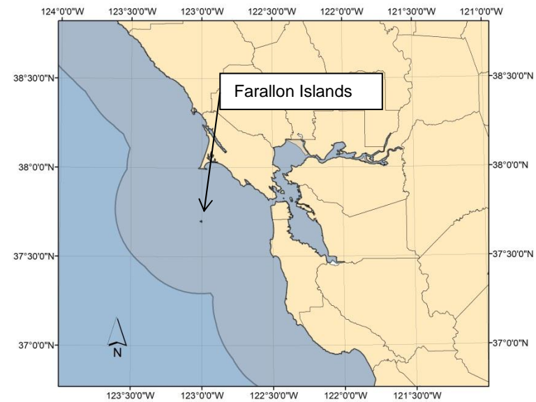
Figure 1b. Bay Area Detail