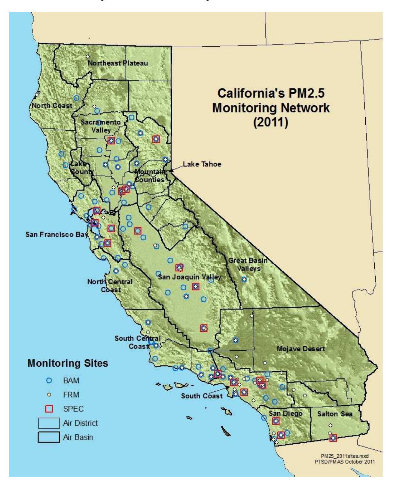
Figure 1: PM2.5 Monitoring Stations in California