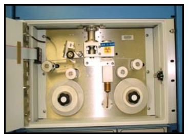
Beta attenuation monitor

Samplers that quantify PM2.5 mass continuously at 106 sites;