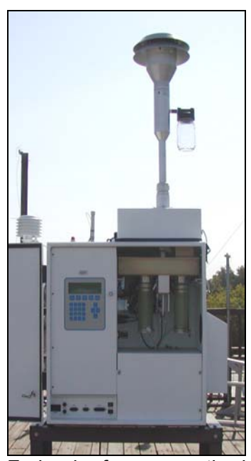
Federal reference method monitor

Federally-approved monitors that measure PM2.5 mass over a 24-hour period at 61 sites;