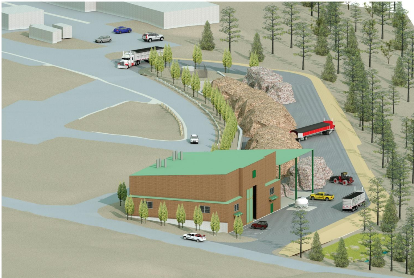
VIEWPOINT 1 VISUAL SIMULATION

CABIN CREEK BIO MASS FACILITY PLACER COUNTY, CALIFORNIA